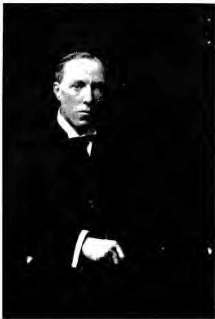
CECIL SHARP IN MIDDLE AGE